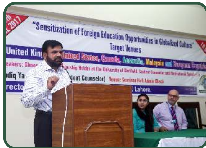
Seminar on Sensitization of Foreign Education Opportunities in Globalized Culture