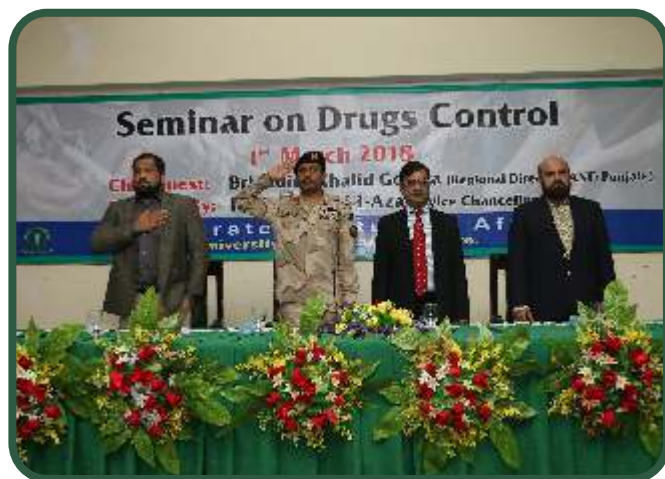
Seminar on Drugs Control