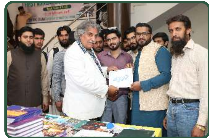
First Annual Book Fair 2018