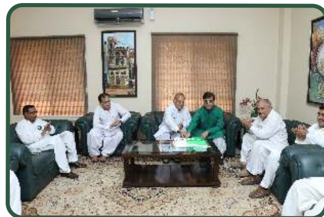
Celebration of 71 st Independence Day