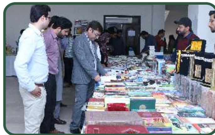
First Annual Book Fair 2018