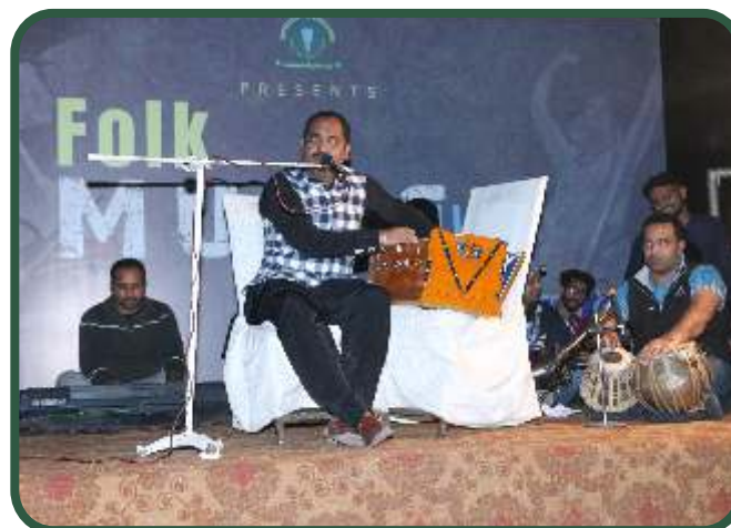
Culture Day - 2018