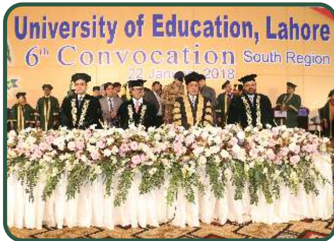
University 6th Convocation