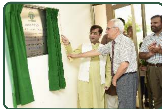
Inauguration: Admin Block-II, UE, Lahore