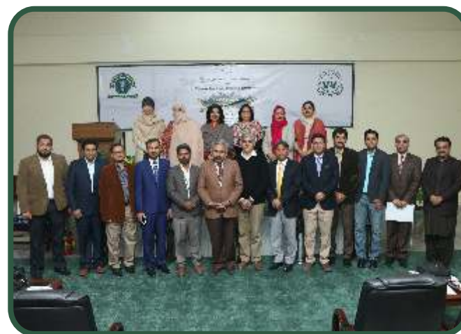
2 Days DSAs Workshop on Peaceful Universities Campuses