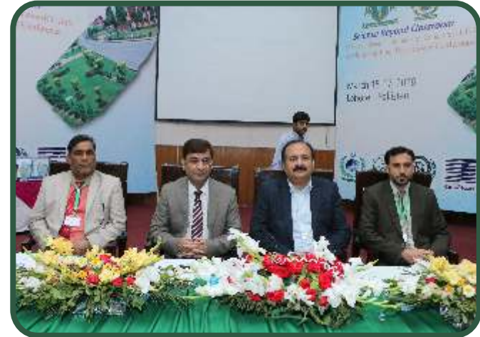
6th International Conference in Education (ICE-2018)