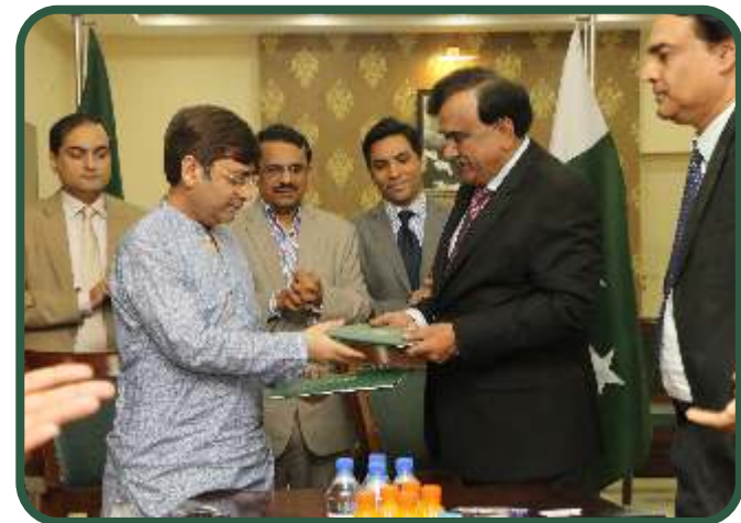
MOU Signed - 2018