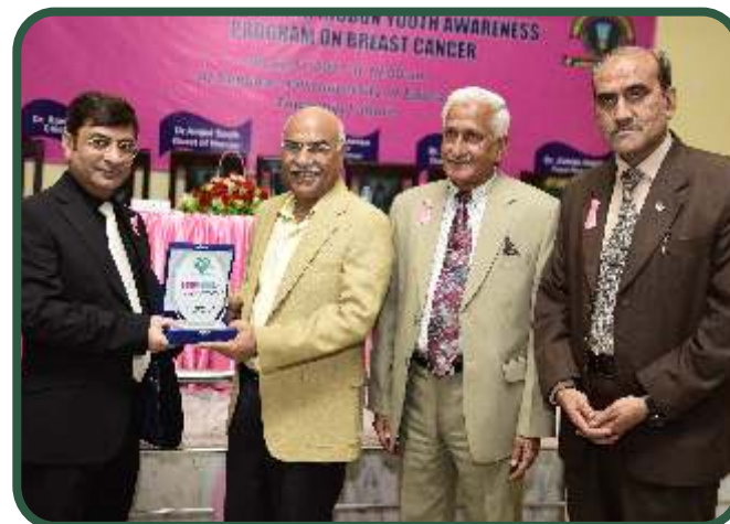
Seminar on Pink Ribbon Youth Awareness